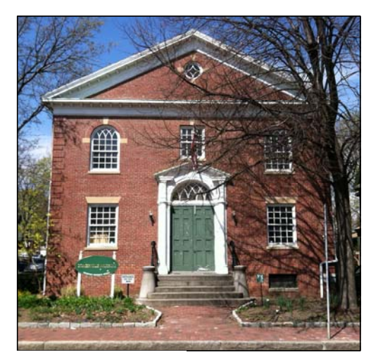
Somerville Museum, One Westwood Road Left: Westwood Road façade with existing entry porch Right: Central Street façade